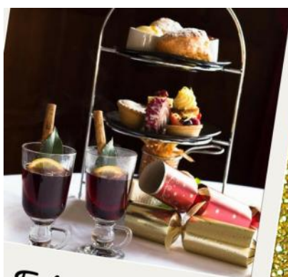
Festive Afternoon Tea

1 Brigg Road Barton upon Humber DN18 5DH