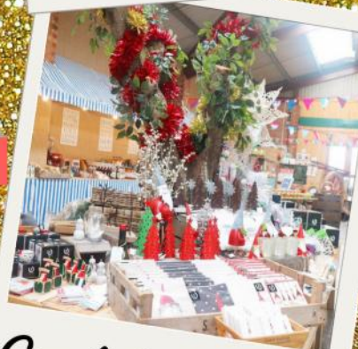
Great Gift Ideas